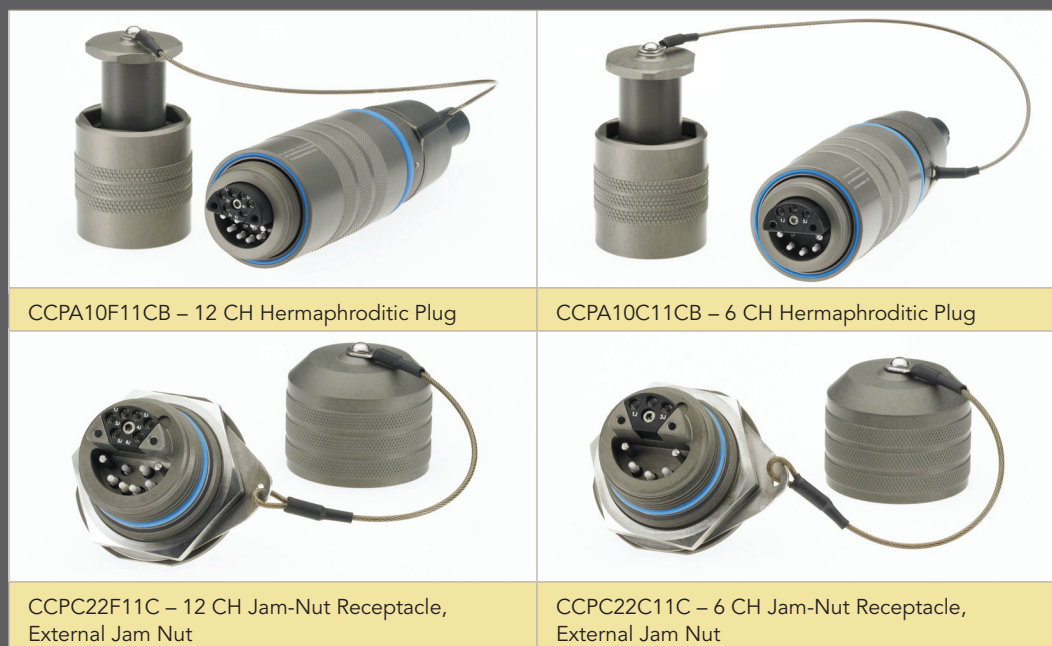
CCPA10F11CB – 12 CH Hermaphroditic Plug