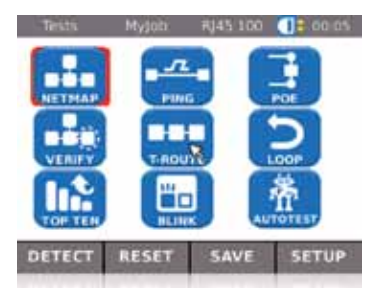
Touchscreen menu navigation allows tests to be completed within three steps